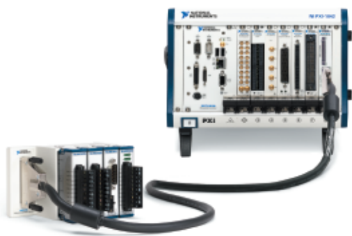
Figure 1. CompactRIO R Series Expansion System for PXI

NI cRIO-9151 R Series Expansion Chassis .....779008-01